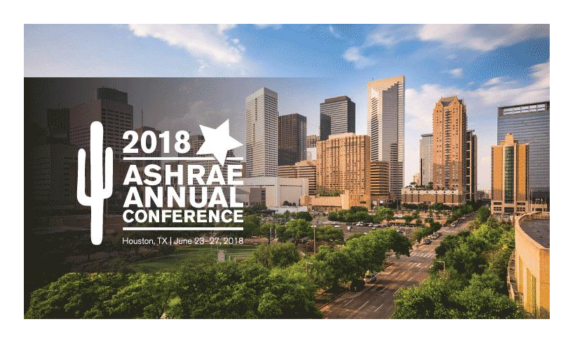
Annual Summer Conference Houston, Texas June 23 - 27